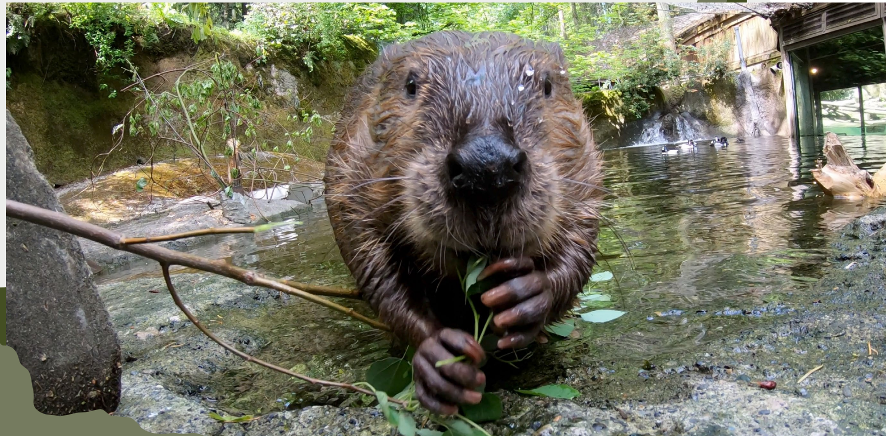
Did you know beavers have recently been credited with reducing wildfire and drought impacts by creating wetlands with their determined dam-building?

To join, renew or give a membership, email membership@oregonzoo.org or call 503-220-2493.